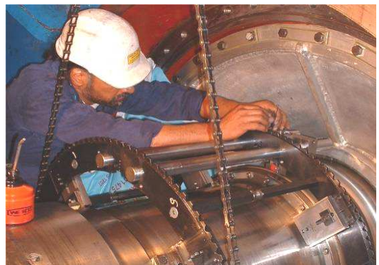
Machining and Polishing of a 610 mm \varnothing Hydrogen Seal Face